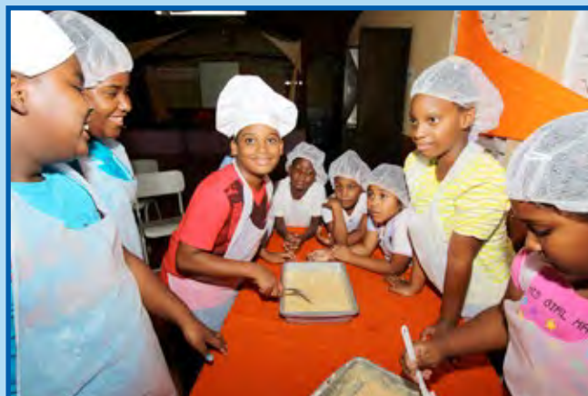
These campers wear huge smiles as they inspect their carrot cake batter