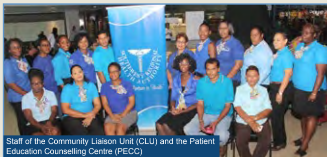
Staff of the Community Liaison Unit (CLU) and the Patient Education Counselling Centre (PECC)

World Diabetes Day is a platform for highlighting the growing concerns about the increase in the number of persons diagnosed with diabetes mellitus. The lives of persons with diabetes can be adversely affected by complications if this chronic disease is left unchecked. The Community Liaison Unit continued to promote diabetes awareness in recognition of World Diabetes Day with activities from Friday 13th to Thursday 27th November, 2015. In keeping with the theme, Healthy Living and Diabetes , each function was intended to heighten awareness about diabetes with the objective of managing type 1 diabetes and the long term goal of reducing the number of persons diagnosed with type 2 diabetes.