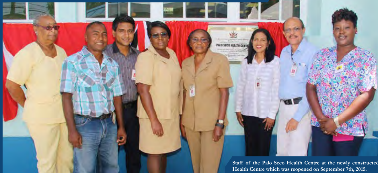
Staff of the Palo Seco Health Centre at the newly constructed Health Centre which was reopened on September 7th, 2015.

On Monday 7th September, 2015 the newly constructed Palo Seco Health Centre opened to staff and clients, a year after healthcare services were relocated to Erin Health Centre. The fully refurbished health facility was rebuilt on the site of the old outreach centre and now provides improved healthcare services to approximately 7,000 residents of Palo Seco and environs.